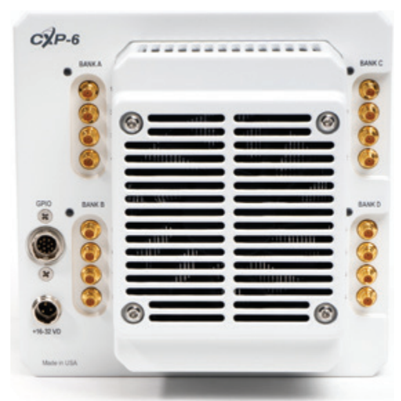
Phantom S710 Connector Panel