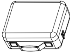
Carrying case (x1)