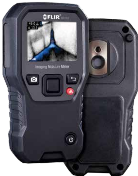
MR160 Imaging Moisture Meter