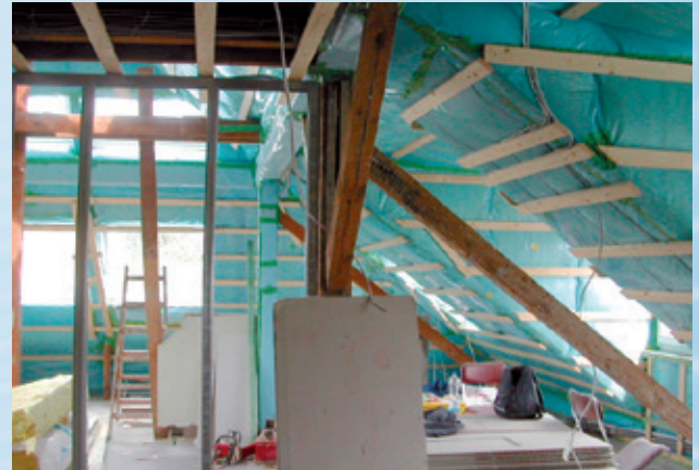
BlowerDoor test for quality assurance during construction

The calibration dates of the BlowerDoor measuring devices used are included in the test log, providing important information on the high accuracy of the measuring technology. The TECTITE Express 5.1 software allows you to select 12 pressure stages for each measurement series. For unfavorable climatic conditions or specific building properties, the accuracy of the measurement can be increased further by entering up to 1,000 measuring points per pressure stage. Each measurement series also includes the interior and exterior temperature as well as the corresponding air pressure.