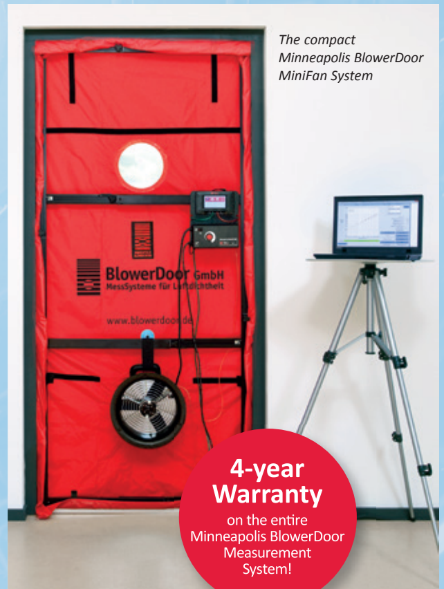
The compact Minneapolis BlowerDoor MiniFan System