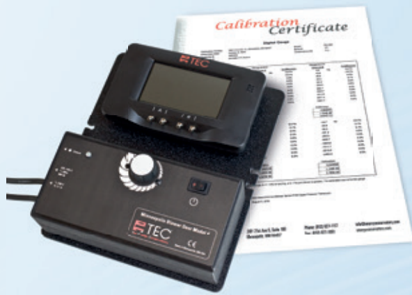
The digital pressure gauge DG-1000 inclusive high resolution Touch Screen, integrated WLAN module and software updates free of charge